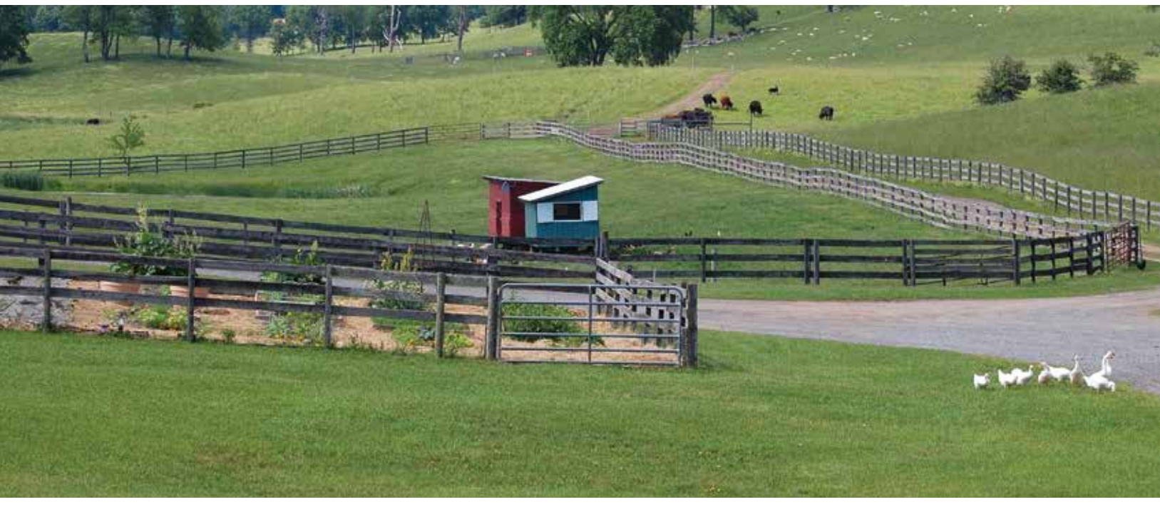
Animals grazing on Kinderhook Farm.