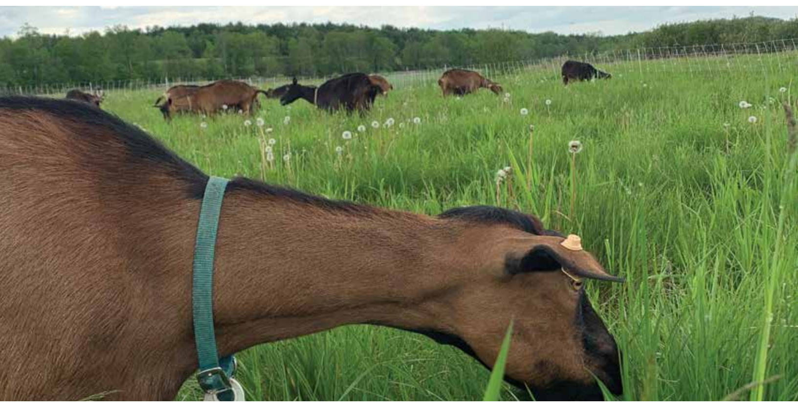
Animals grazing on Consider Bardwell Farm.