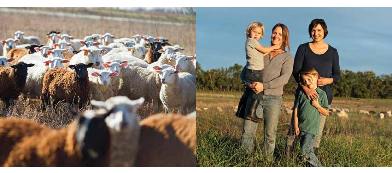
Animals grazing at the Central Grazing Company farm.